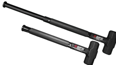
Collapsible Sledgehammer SHX30-8 | SHX30-6