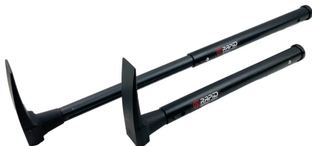
Collapsible Pry Bar PBX30