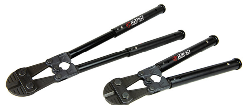
Collapsible Bolt Cutter BCX30