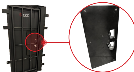
Strike Plate Cover