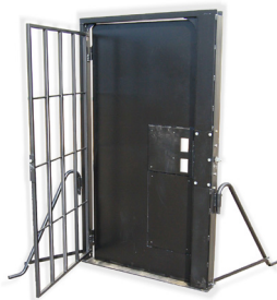
Burglar Door Pry