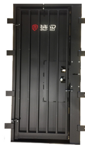
Burglar Door Cut