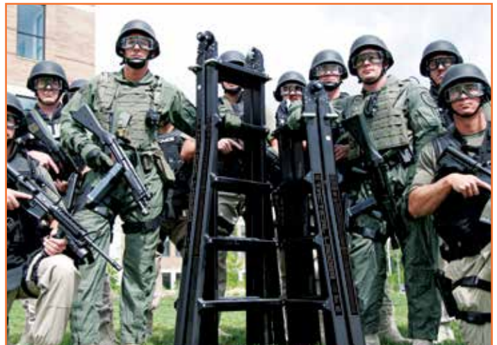
Subdued finish technology improve operator stealth and safety.