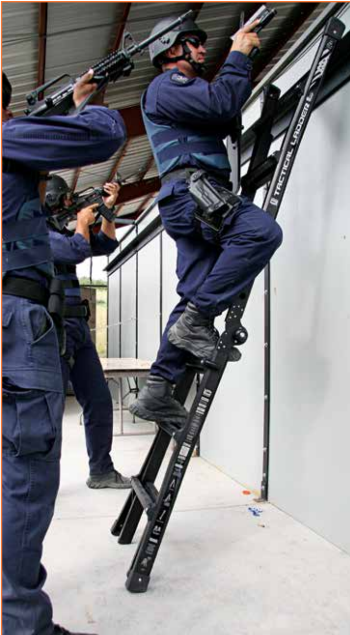
Extra heavy duty (ANSI Type IA - 300 lbs) rating for extreme conditions.