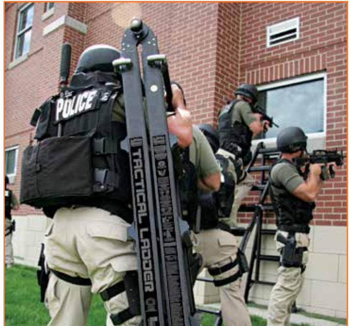
Versatile enough for almost any assault scenario.